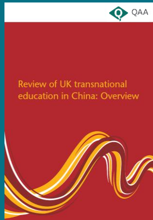
Country overview report